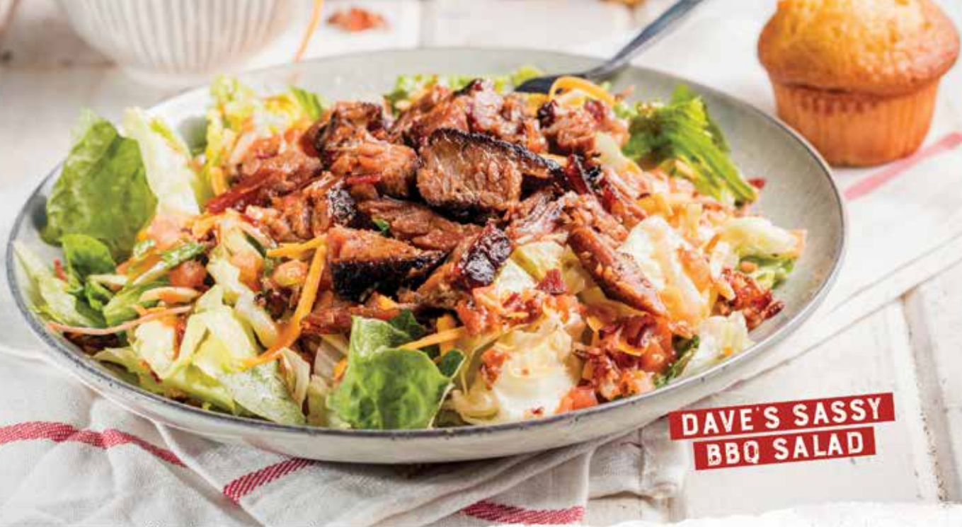
DAVE'S SASSY BBQ SALAD